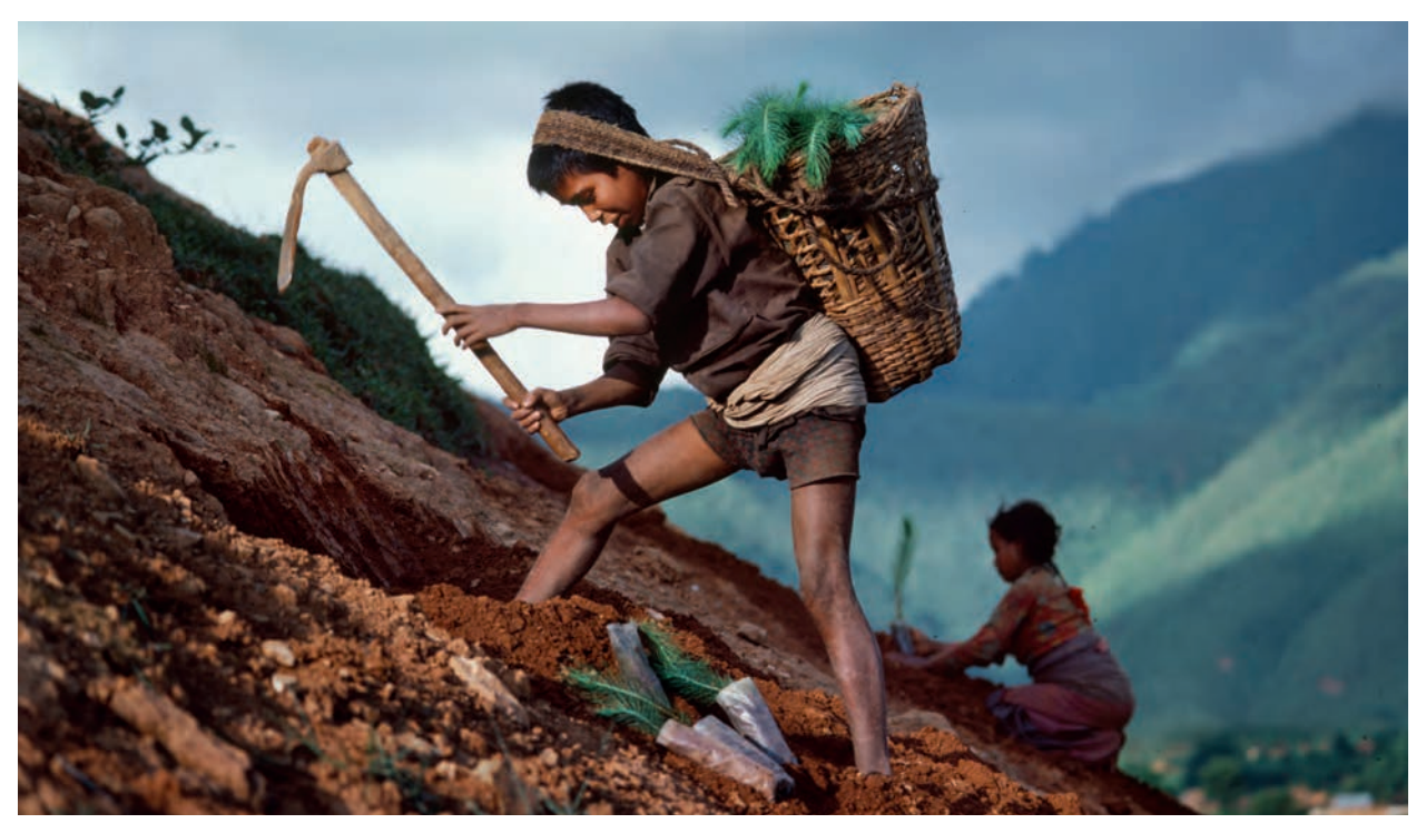
NCL and the CLC are working to reduce the number of children trapped in child labor.