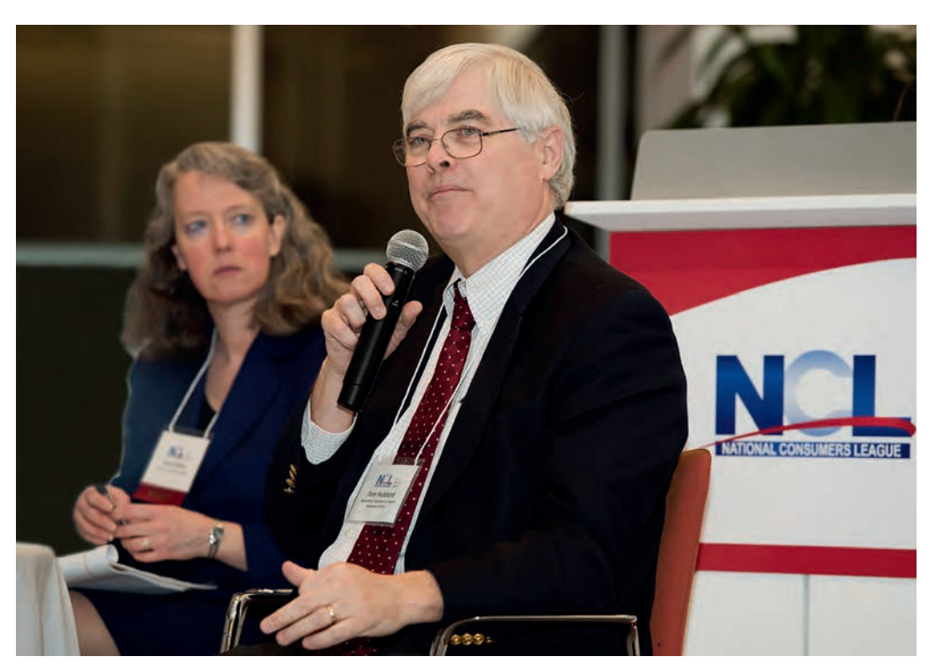
NCL's Health Advisory Council offers opportunities for collaboration on policy priorities.

Script Your Future wallet cards distributed in 6 lanuages: English, Spanish, Chinese, Vietnamese, Hmong, and Russian