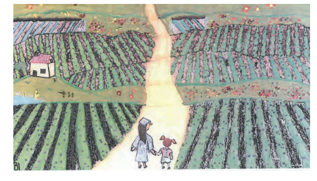
A child farmworker's creative expression about balancing the harvest with personal advancement.

NCL is grateful to collaborate with dozens of CLC members, including the American Federation of Teachers, which serves as a CLC co-chair with NCL, and several other national labor unions, which serve as members. To see the full CLC roster, visit StopChildLabor.org.