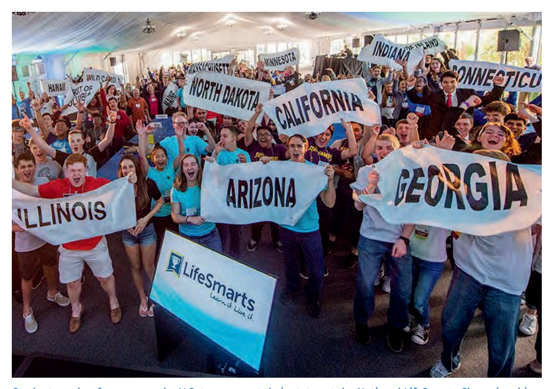
The LifeSmarts impact