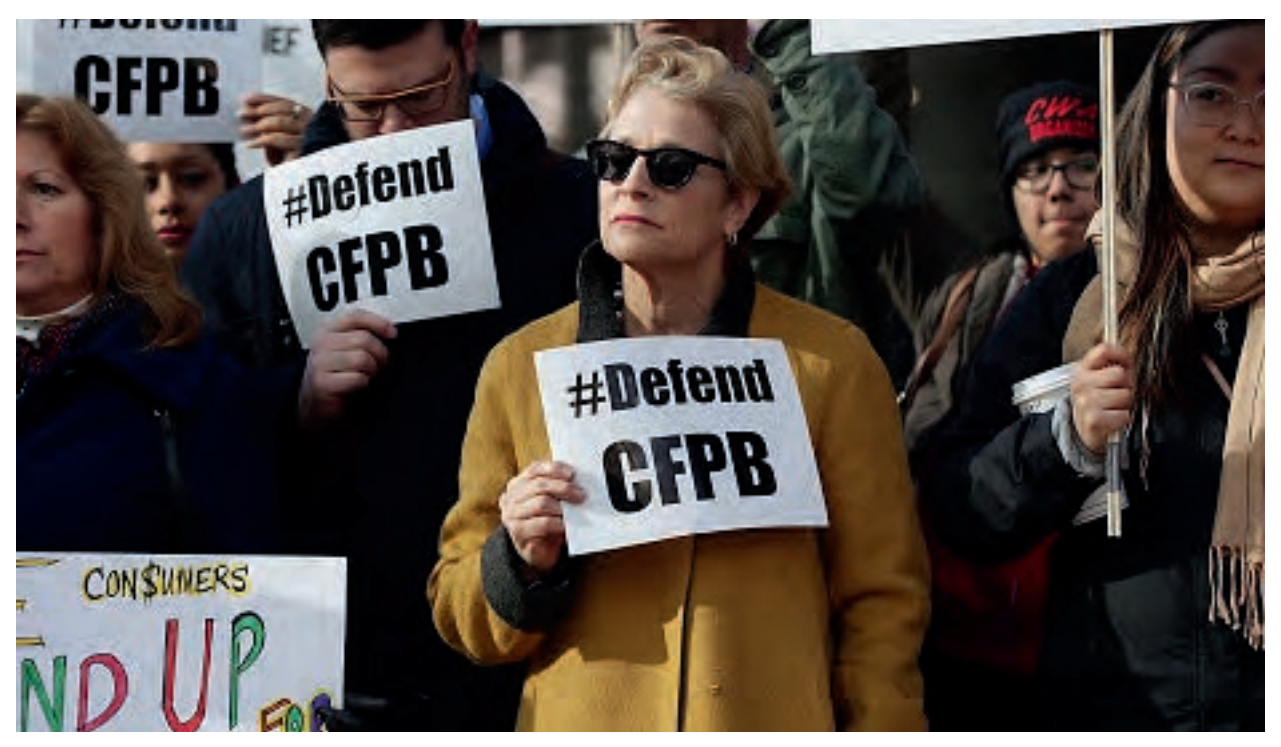
NCL has continued to defend the dismantling of the Consumer Financial Protection Bureau.

Cop on the beat. NCL operates Fraud.org, America's go-to resource for consumers, educators, and law enforcement on fraud education and prevention. Through monthly Fraud Alerts and direct counseling, NCL helps victims of fraud and their families and shares data with law enforcement to track trends and criminal activity.