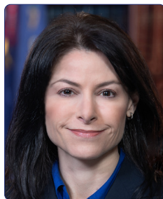
Attorney General Dana Nessel State of Michigan